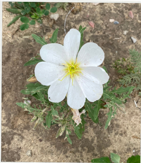
White-stemmed Evening Primrose

White flower, turning pink after pollination-often in sandy soil.