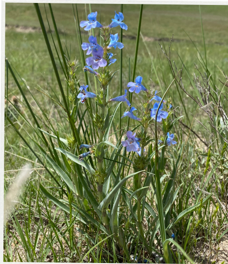
Penstemon - Beardtongue

White flower, turning pink after pollination-often in sandy soil.