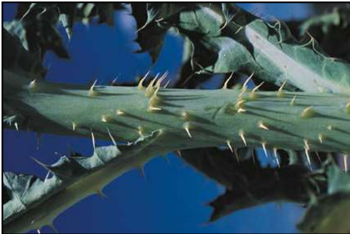
Yellow spines along the main stem and leaves prevent livestock from using this plant.

Annual pricklepoppy is a native plant to the Rocky Mountain region occurring in pastures, waste areas, and along roadsides. It is seldom abundant and can be an indicator of overgrazing. Its spines make it undesirable for livestock feed. The prickles have been known to irritate the skin of some people. Although it produces beautiful flowers, it is generally considered a nuisance because of its unpalatability.