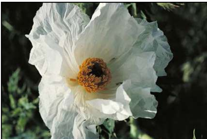
Large showy flowers with yellow centers blossom in late summer.